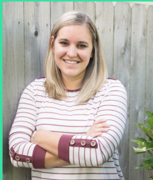
Director of Curriculum