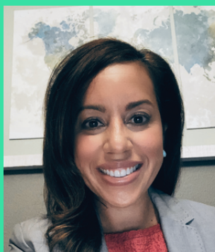
Director of Partnership