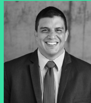
Director of Implementation