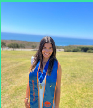
Director of Technology